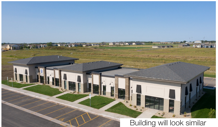
Building will look similar