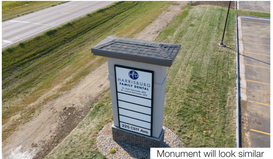
Monument will look similar