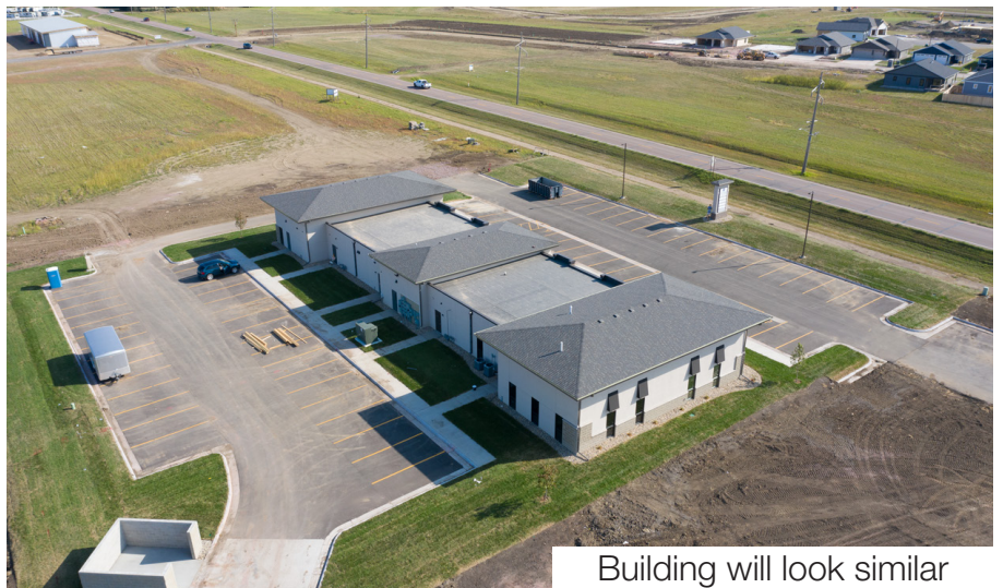
Building will look similar