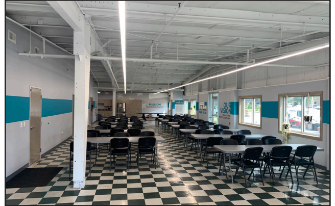
Employee Meeting Space