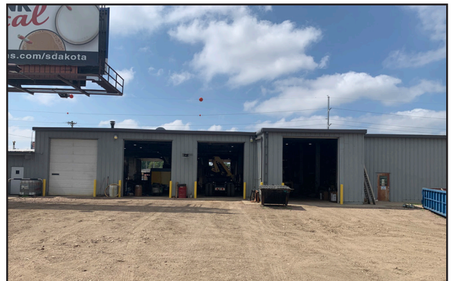
View from North