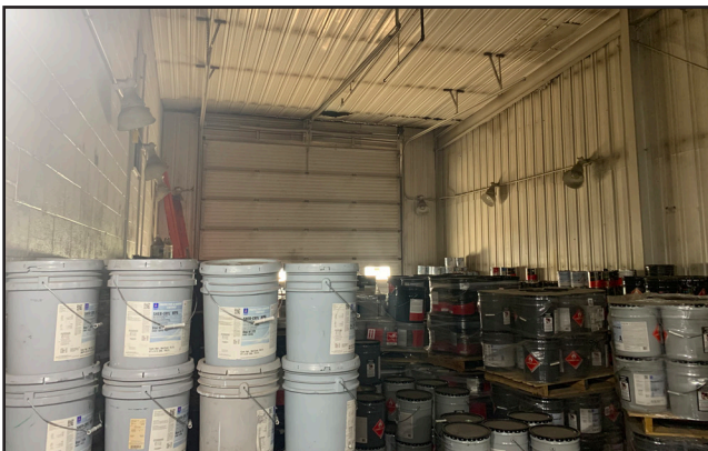
West Bay - South Portion