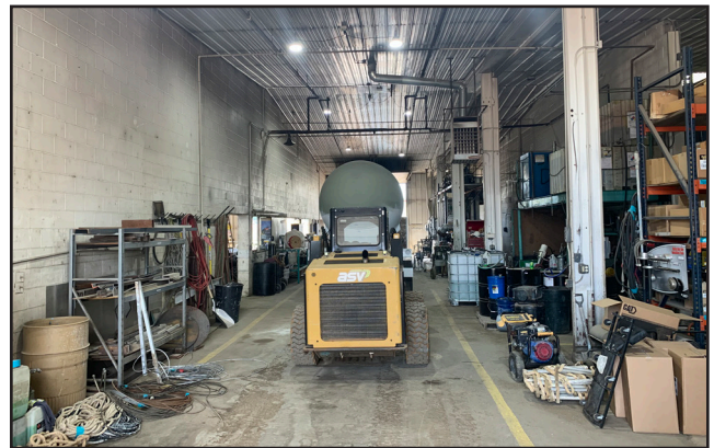
East Bay - View from North