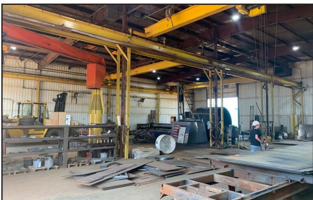
Building 2 - View Looking Northwest