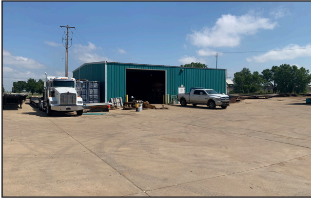
Maintenance Building Looking North