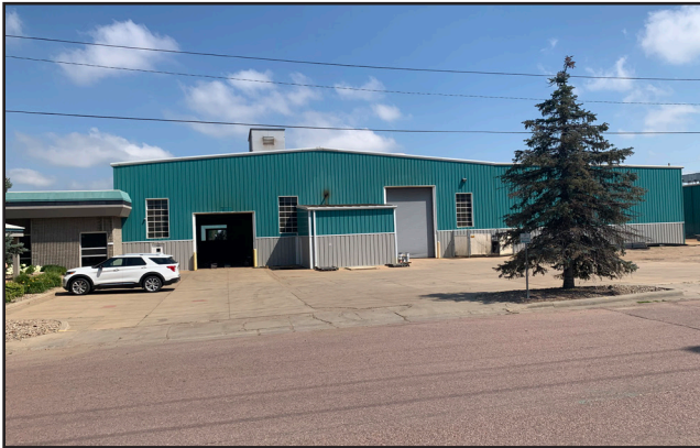
South View - Building 1 - Main Fabrication