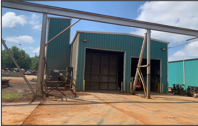
Building 4 - View from North