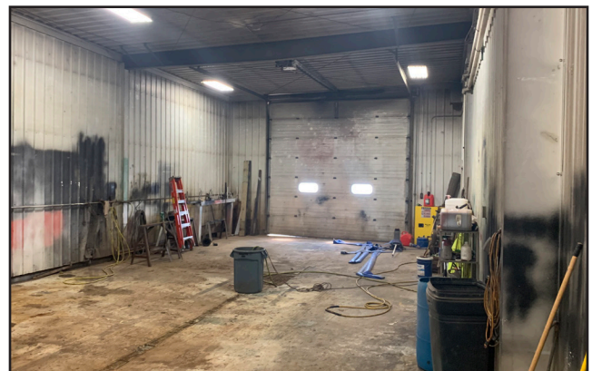
Building 3 - Wash Bay