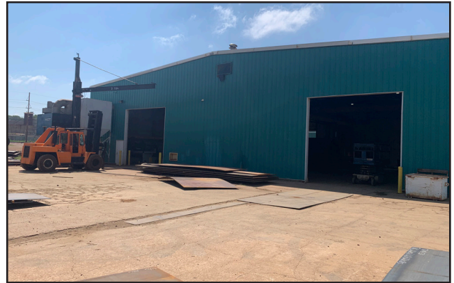
Building 2 - View from Southeast