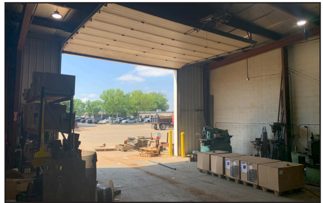
Building 3 - Interior