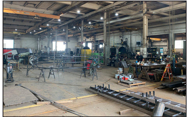
Building 1 - Interior - West Bay