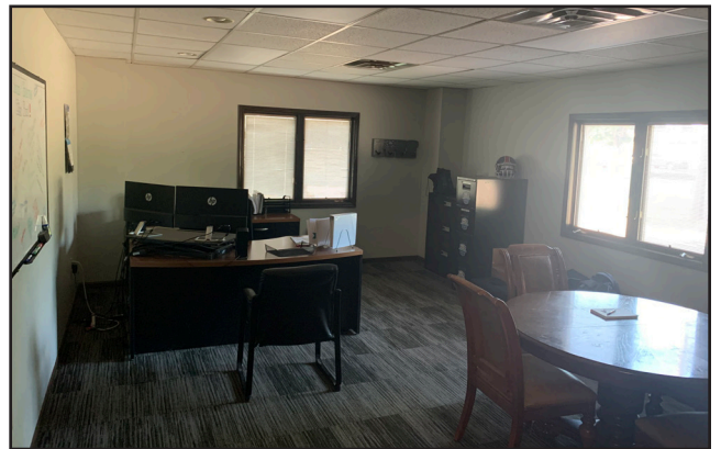
Building 1 - Manager Office