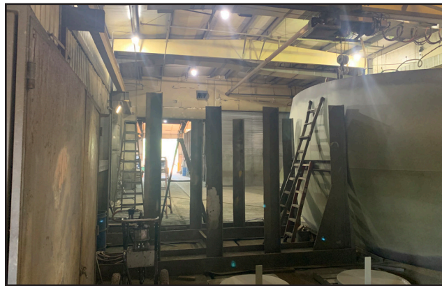
Building 4 - Interior - View Looking North