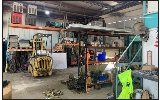
Building - Interior