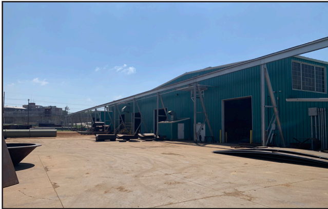
Building 2 - South Side