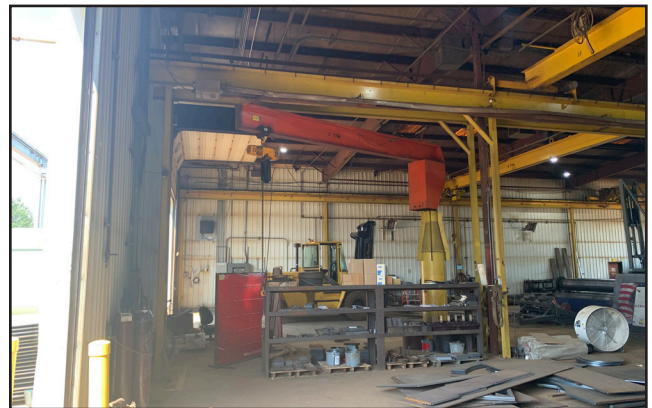
Building 2 - View Looking West