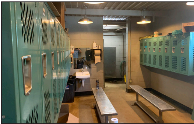
Building 1 - Employee Locker Room