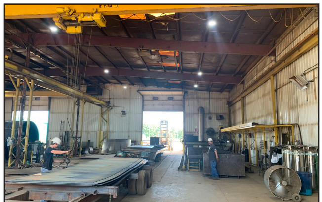
Building 2 - View Looking North