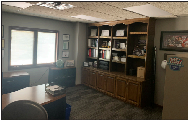
Building 1 - Manager Office