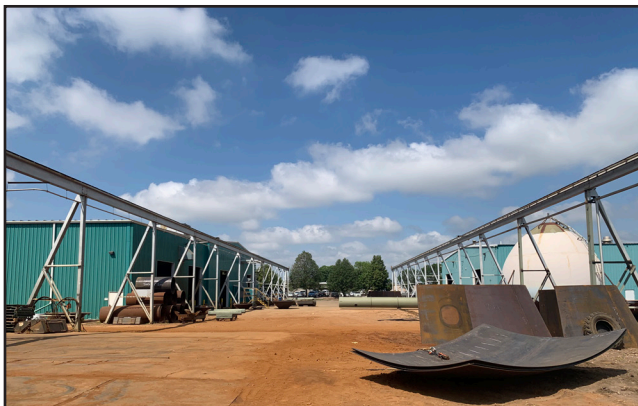
Outdoor - Overhead Crane - From East End