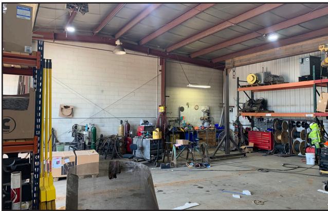
Building 3 - Interior