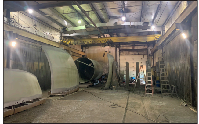
Building 4 - Interior - South Portion View from North