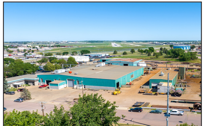
Buildings 1 & 4 from Southeast