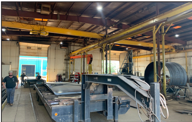
Building 2 - West Side