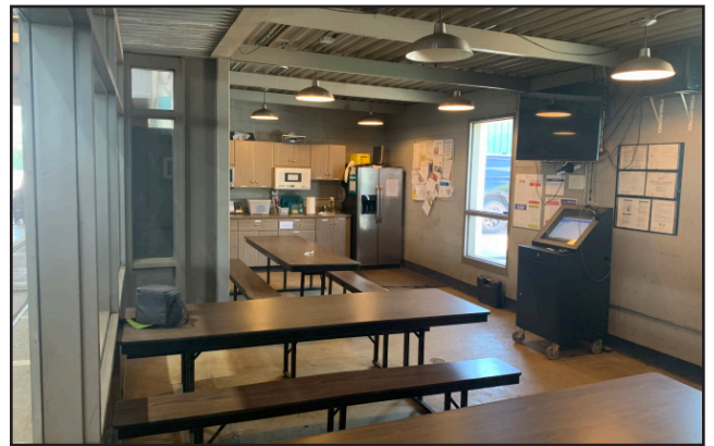
Building 1 - Employee Breakroom