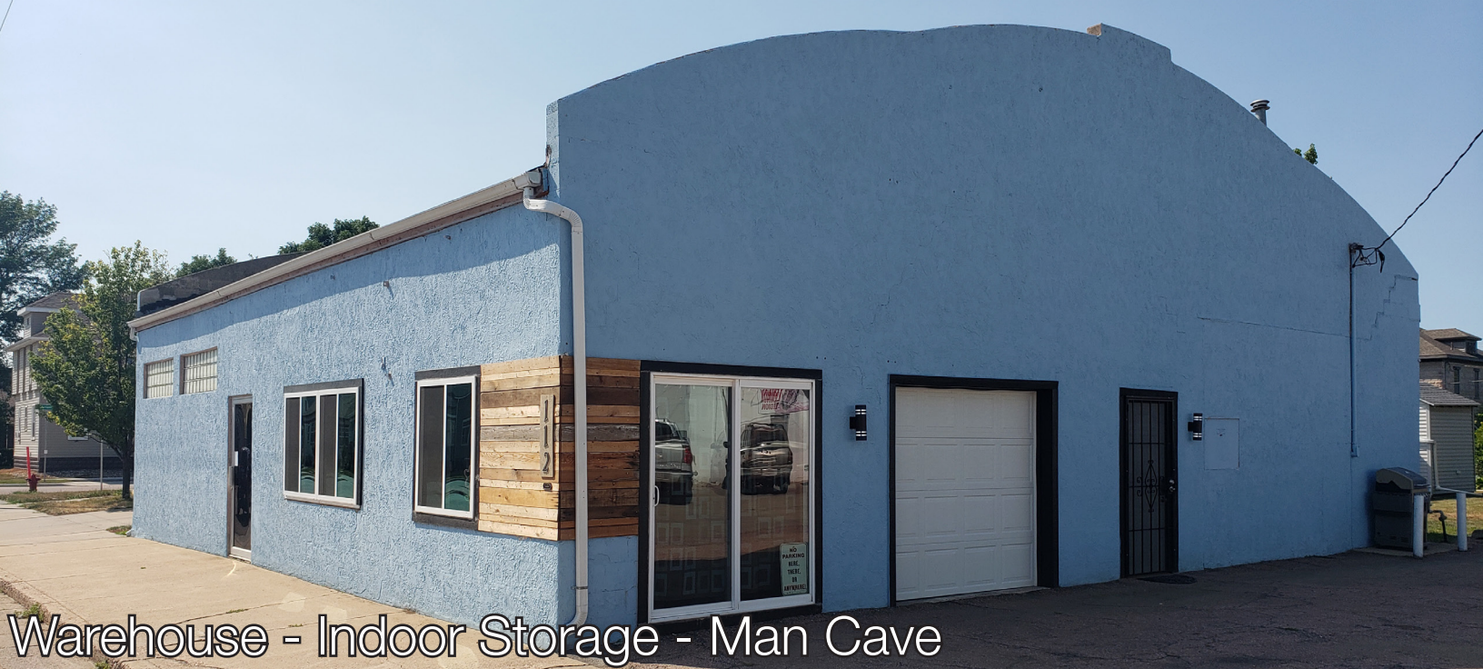
Warehouse - Indoor Storage - Man Cave