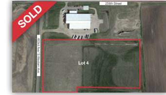
Hartford Light Industrial Land Hartford, SD

Sold for $1,568,160 - 18 acres Stacey Sieverding