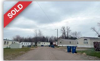
Foley Mobile Home Park Foley, MN