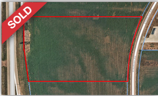
Jansmick Land Sioux Falls, SD

Sold for $2,348,535 - 5.13 acres Dennis Breske