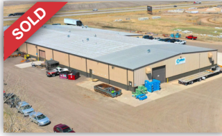
Ironworks Industrial Harrisburg, SD