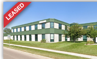
2600 W. 49th Street Sioux Falls, SD 15,262 sq. ft.