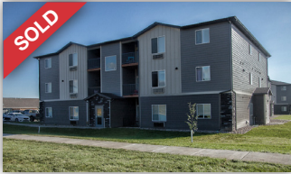
Champion Villas Rapid City, SD